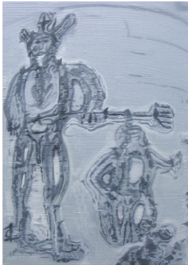
The Devil And The Sinner, 2009 17 x 12 in, oil on linen